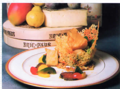
A wide selection of starters.