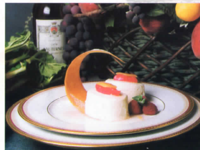
All desserts are home-made.