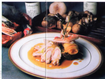
Main courses change daily, fish and seafood being our speciality.